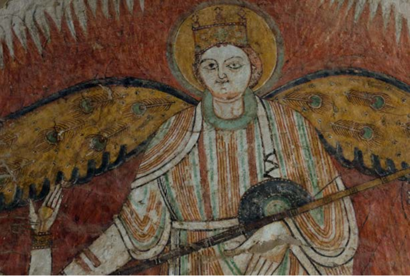
A Christian fresco of the Archangel Michael from the ancient Sudanese city of Faras (now underwater due to flooding from Egypt's Lake Nasser) is on display in the Khartoum National Museum. Many of Sudan's historic artifacts have been excavated and preserved with the assistance of western experts, and Sudan's ongoing archaeological sites remain of great interest to university researchers.

US colleges and universities, and through low-cost options like podcasts by academics. Some academic connections exist between the United States and Sudan—especially through the Sudanese diaspora in the United States—and should be leveraged. A similar opportunity offers to develop a curriculum on US literature for Sudanese students, particularly for those wishing to advance their English-language study.